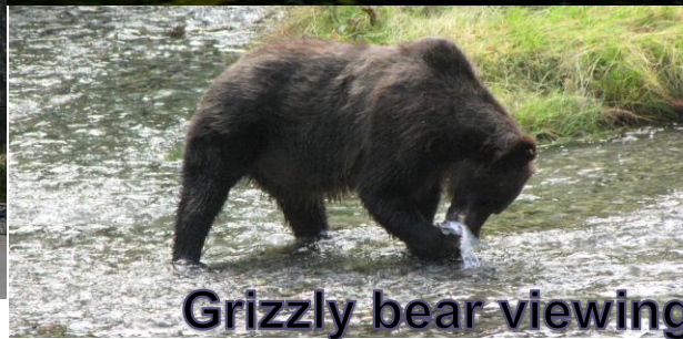
Grizzly bear viewing